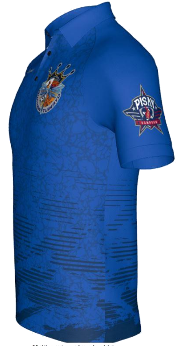
Multisport men's polo shirt