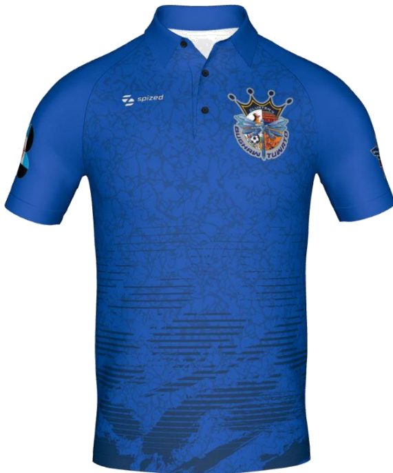
Multisport men's polo shirt