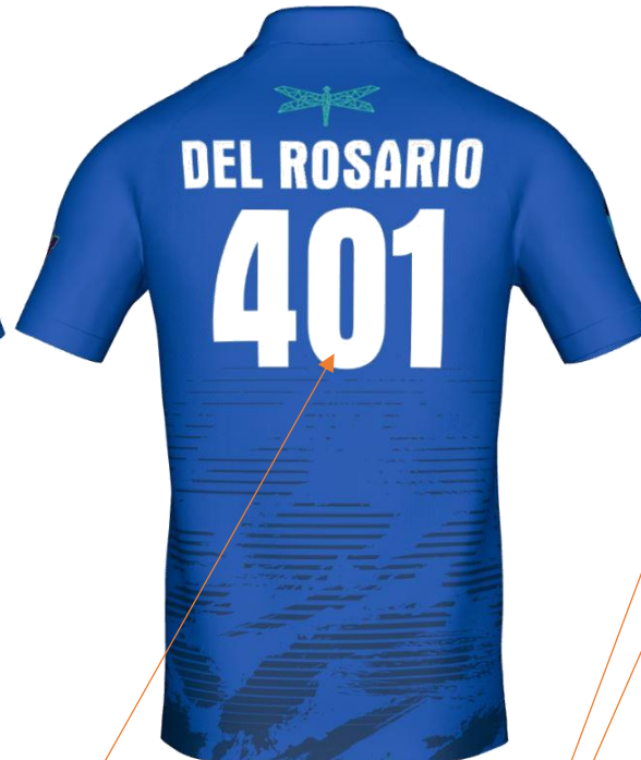
Multisport men's polo shirt