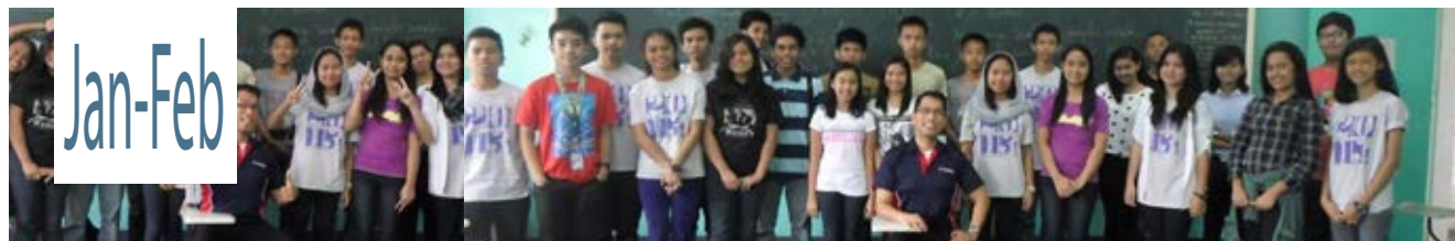
2014 Regional Invention Competition and Exhibit (RICE), January 14-17, 2014 held SM City, CDO