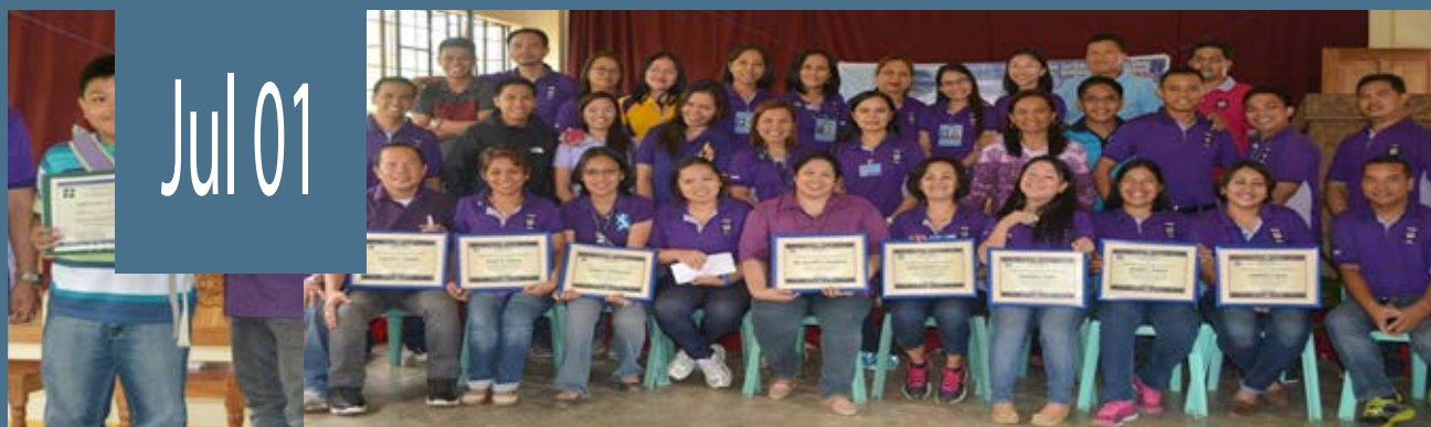
16th Foundation Day. July 1, 2014