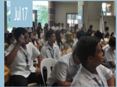
Ateneo de Manila University Career Talk. July 17, 2014 at PSHS-CMC