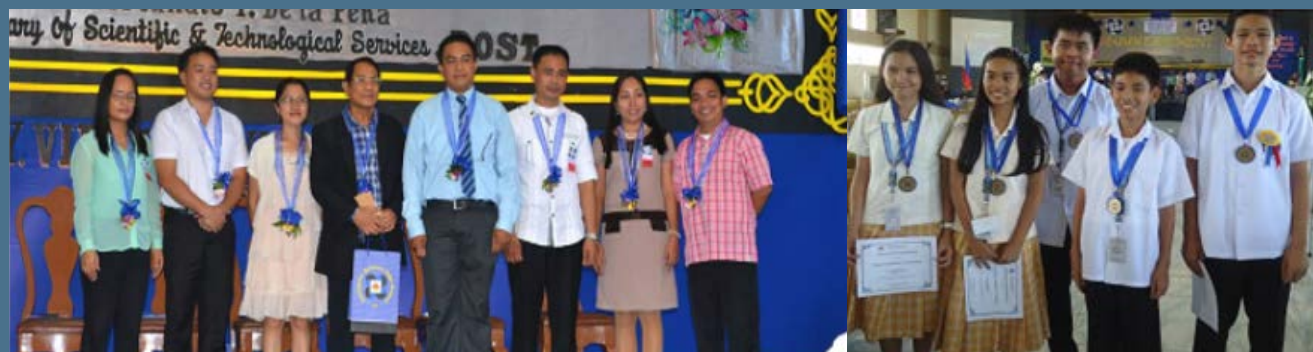
2014 Recognition Day. March 30, 2014 @ Lyceum Foundation of Iligan, Iligan City