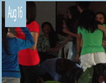
Recollection for Grades 7-8. Aug. 16, Aug. 22, and Sept. 6, 2014 at Inahan sa Kinabuhay, Del Carmen, Iligan City