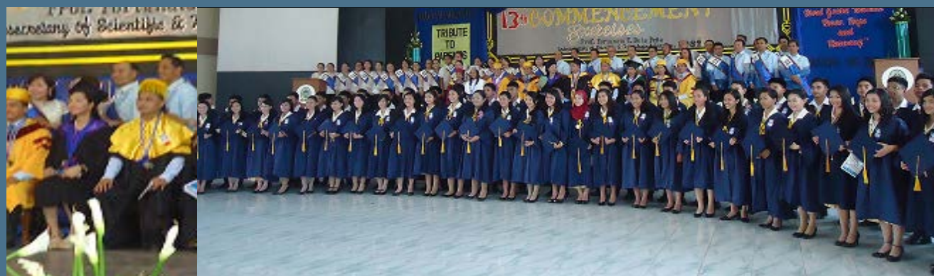
13th Commencement Exercises March 30, 2014 at Lyceum Foundation of Iligan, Iligan City