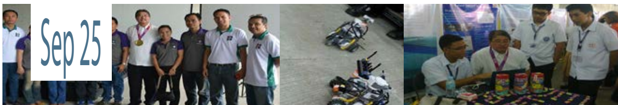
Conduct of 1st Region-wide Community Science Fair. September 25, 2014 @ SM City, Cagayan de Oro City