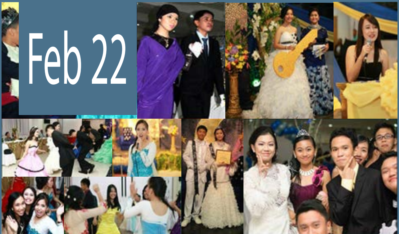
JS Prom 2014 February 22, 2014 @ Elena Tower Inn, Iligan City

All scholars have equal access to academically and developmentally enriching opportunities that will enable them to not only learn and thrive at every grade level, prepare them for work and or college as confident, and contributing adults, but also allow them to enjoy life like any other growing young individuals in the society.