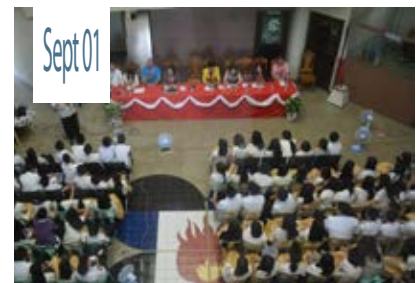
Installation of New Campus Director September 01, 2014