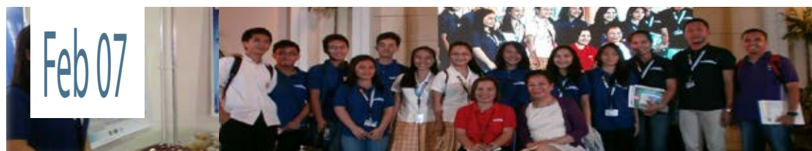
MTG Mathematical Challenge for Filipino Kids Training Program (MCFKTP). January-February, 2014 @ Lanao Chung Hua, Iligan City