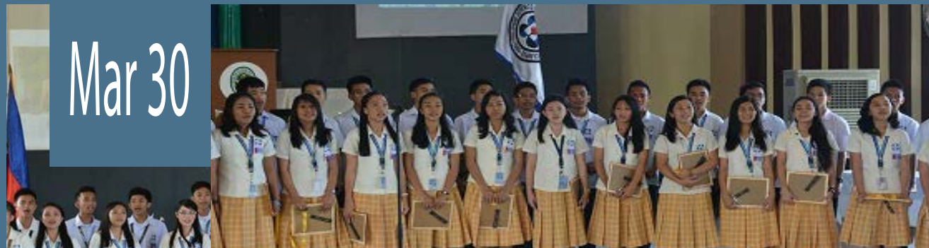
2014 Tribute to Parents. March 30, 2014 @ Lyceum Foundation of Iligan, Iligan City