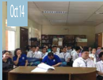
Xavier University Career Counselling. Oct. 14, 2014 at PSHS-CMC