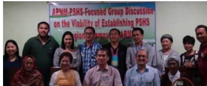
Hosted the Meeting of PSHS System Officers with the ARMM Officials.