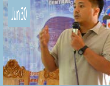
Seminar on Violence Against Women and Children. June 30, 2014 at PSHS-CMC