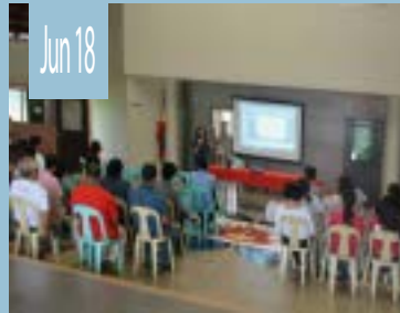
Seminar on "Determining Students with Special Needs and Their Proper Intervention". June 18, 2014 at PSHS-CMC