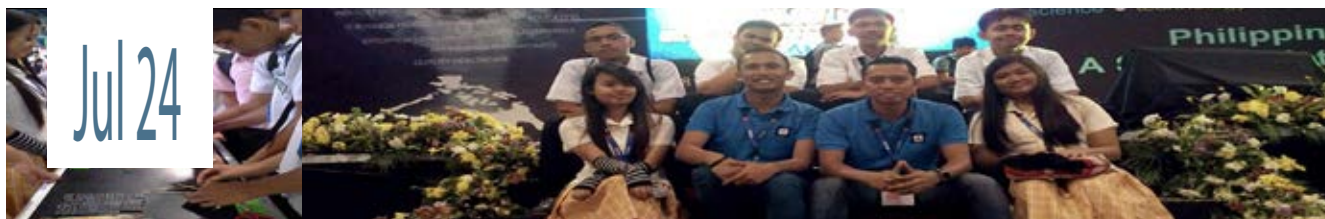
Participated in 2014 National Science Technology Week. July 24 – 29, 2014 at the SMX Complex, Mall of Asia, Pasay City