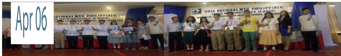
Participated in 2014 PSHS System National Science Fair Community Exhibit. Feb 7-12, 2014 @ FPLA, Antipolo City and @ PSHS Main Campus, Agham Road, Diliman, Q. C.