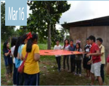
Values Formation Youth Camp March 14-16, 2014 at PSHS-CMC 66 females and 45 males