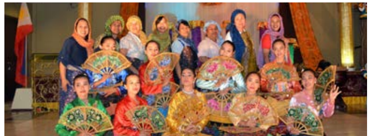
"PAGANA" Ceremony to Welcome the Campus Directors May 29, 2014 @ Plaza Alemania