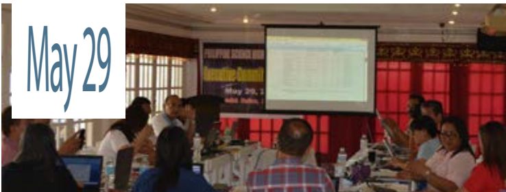
Hosted ExeCom Meeting. May 29, 2014 @ Cheradel Suites, Iligan City