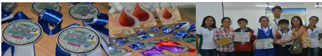
Conduct of 1st Regional Invitational Quiz Show. September 25, 2014 @ SM City, Cagayan de Oro City