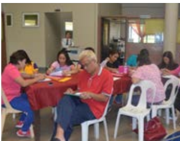
In-Service Training for Faculty and Staff